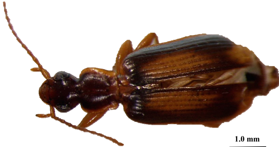
Fig. 2. Dorsal view of a male Dromius angustus alutaceus Wollaston, 1857