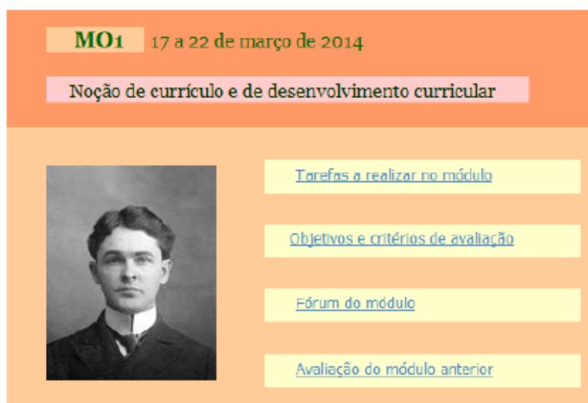
Figure 12: Typical structure of a module

In order to obtain information or to interact with the instructor and with classmates in the context of each of those components, the student accesses, via hyperlinks, specific pages, which, as figure 12 illustrates, are considered at the third level of analysis. This is the level at which teaching and learning are managed more directly.