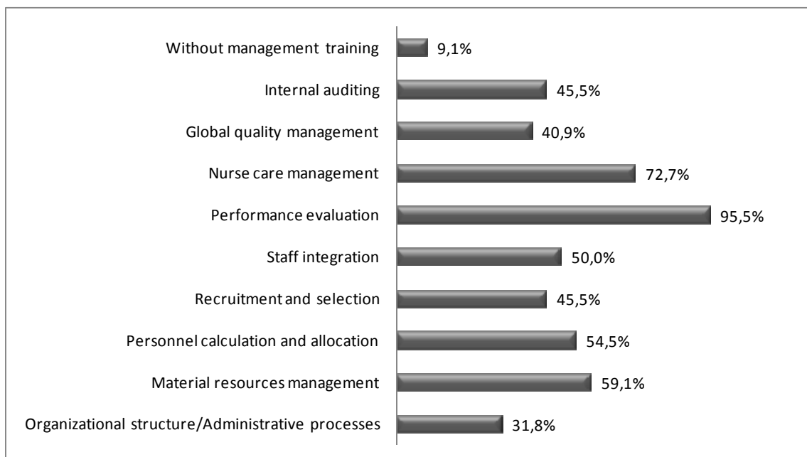
Figure 2. Sample distribution according to management training received by nurses in leadership roles