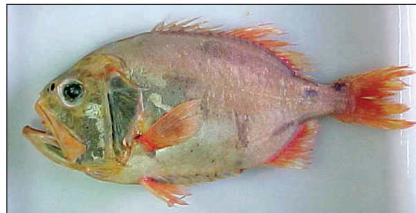
Fig. 2. Gephyroberyx darwinii 56. TRACHI.001, 373 mm SL, 2001.

Trachichthyid fishes are known for their long lifespan