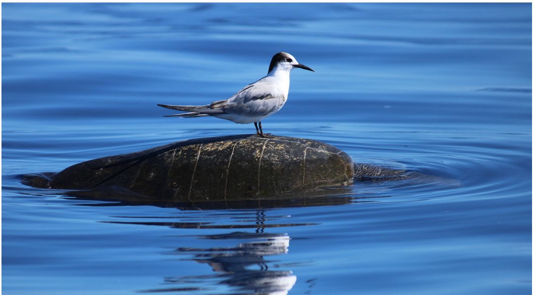
Figure 2. A Common Tern ( Sterna hirundo ) pausing on top of an Olive Ridley Sea Turtle ( Lepidochelys olivacea ), near São Miguel Island in the Azores (37.9676°N, 26.1671°W). Note the seven lateral scutes on the turtle.