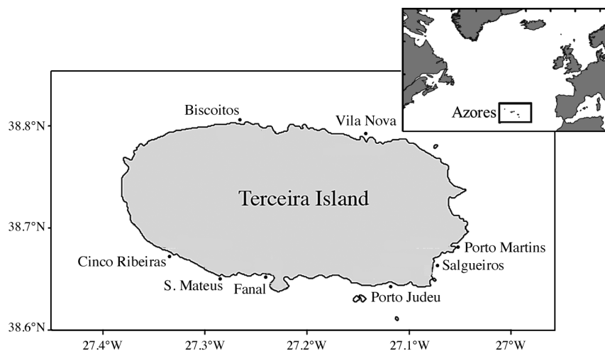
Figure 1. - Terceira Island, Azores Archipelago (NE Atlantic). (•): Sampling locations.

In the Azores, Anilocra physodes parasites are commonly observed attached to a wide range of fishes although the impact