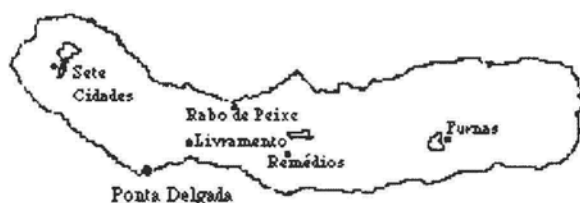
Figure 1 : Districts of the capture of the Hymenoptera in the Island of S. Miguel, Azores, 1989.

ding to the technique described by Pintureau (1987).