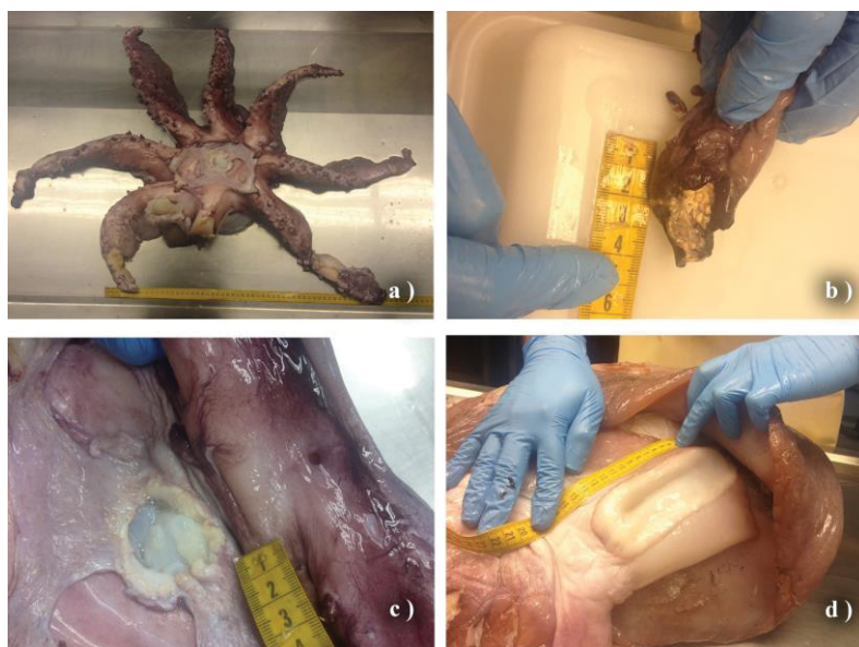
Fig. 1. a) Brachial crown of Taningia danae . b) Light organ on arm tip II. c) Pore between arm pairs III and IV. d) Funnel cartilage.

All biometric measurements are shown in Table 1. Some intramuscularly embedded spermatangia were observed on the edge of the ventral side of the mantle, in proximity to the funnel (Fig. 3), indicating that the specimen was probably a mature female. Implanted spermatangia in the mantle and other body surfaces of T. danae have often been reported associated with male-inflicted wounds, probably made by males using their beak or arm hooks (Hoving et al. 2010). We also observed incisions close to the area of embedded spermatangia, supporting this hypothesis.