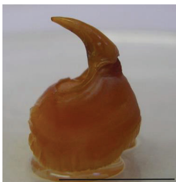
Fig. 2. Shape of a hook removed from arms pair IV. Bar scale correspond to 1 cm.