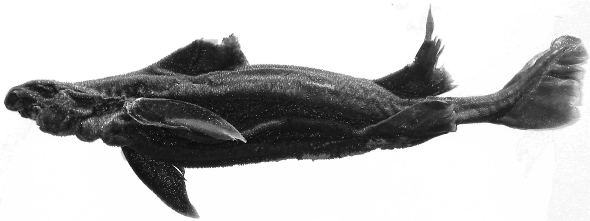
Figure 1. - Oxynotus paradoxus from the Azores (MCM 955, male, 549 mm TL).

Body measurements are given in table II, and compared