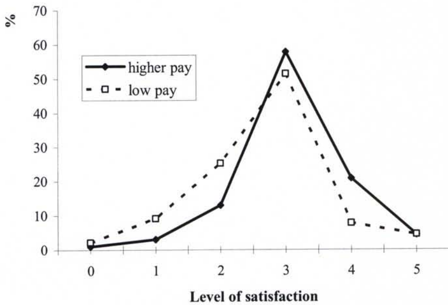
Figure 2 - The distribution of Job satisfaction (1997)