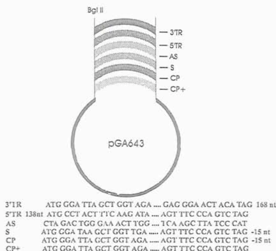
Fig. 1. Schematic presentation of the 6 different vectors and primers used for their amplification used for transformation. CP+ contains the entire coat protein sequence; CP contains the coat protein gene with an internal deletion of 15 nucleotides; S contains the same sequence in sense orientation, but without start codon, so that no protein synthesis is to be expected; AS contains the CP+ sequence in antisense orientation, therefore also yielding no protein, and; 5'TR and 3'TR are truncated sequences either at the 3' or 5' end of the CP+ sequence shortened 168 and 138 nucleotides respectively.

To optimize the level of kanamycin during selection we observed a kanamycin response curve after 2 months exposure to the antibiotic (Fig. 2) with special attention to the root development of grape somatic embryos. Only high concentrations (more than 100 mg/l) were lethal. Up to 50 mg/l kanamycin secondary embryogenesis was observed in some of the