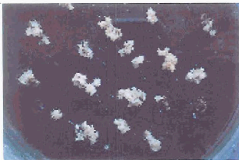
Fig. 4. Transgenic embryos of line 7-3/2E 1 after several months of selection (75 mg/l kanamycin).